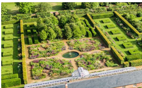
The Walled Garden at Scampston Hall